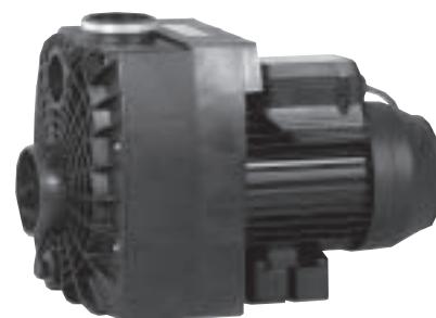
43 Series Pump with no strainer (NS)