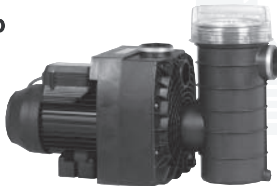
43 Series Pump with large strainer (LS)