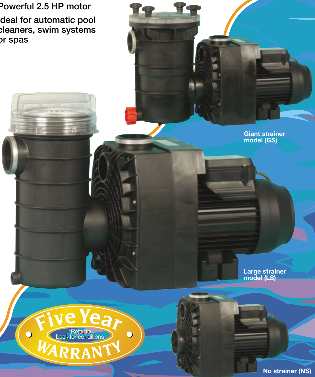
Giant strainer model (GS)