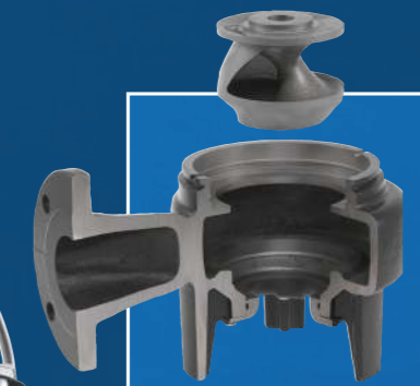
SL1: Single-channel impeller