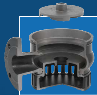
DP: Semi-open multi-vane impeller