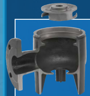
SLV: SuperVortex impeller

The SLV pumps range has a SuperVortex impeller and is ideal for liquids with a high concentration of solids, fibres, or gassy sludge, while the SL1 pumps range has a single-channel impeller and is ideal for large flows of raw sewage.