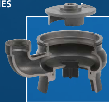
EF: Open single-vane impeller