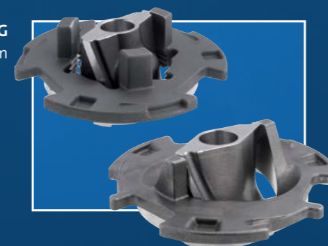
SEG Cutter System

The Grundfos patented grinder system ensures the reliable and efficient grinding of solids to even smaller pieces. In addition to extremely effective and reliable operation, service is easy, with quick dismantling for replacement of wear parts requiring no special tools.