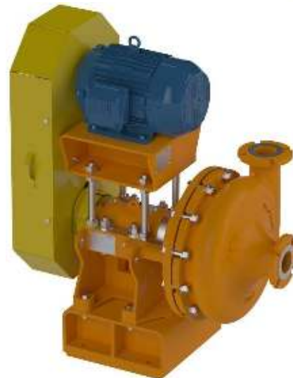
K-TC3 Horizontal Vortex Pump set

KETO holds a comprehensive stock of spares for the K-TC range. KETO can also supply conversion kits or spares for other brands of vortex pumps.