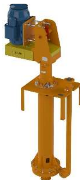
K-VTC3 Vertical Vortex Sump Pump Set