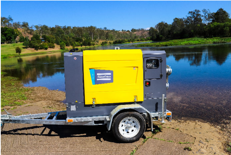
Indicative picture of the product