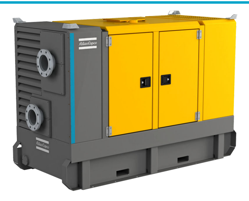
PAS 150MF 250 Liquid cooled engine